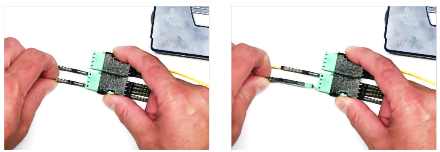
Figure 1: MMC Removal

When using the OPTIPOP Connector Cleaner, there is an option for a non-pinned and pinned version of the cleaner. Ensure the correct cleaner is purchased for both pinned and non-pinned capabilities. This cleaner will allow for a dry or a wet/dry clean. Simply start by removing the connector from the adapter by pulling the connector by the black boot shown in Figure 1 below.