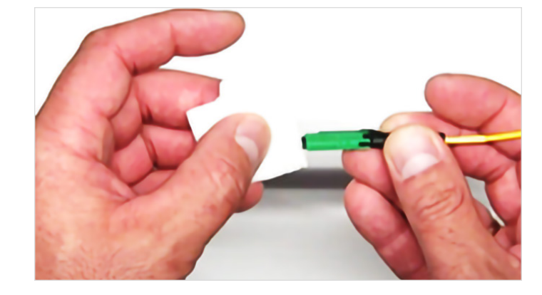
Figure 4: Applying Cleaner to Connector (Left Non-Pinned, Right Pinned)