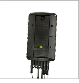
BPEO Splice Enclosure