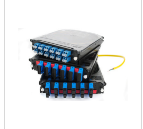
Pigtailed Splice Cassettes