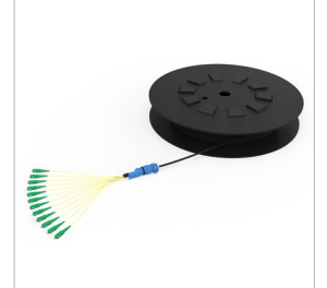
MiniXtend® Outdoor Cable Assembly