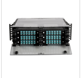
CCH Rack-Mount Housings