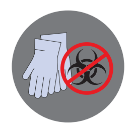
Gloves or Biohazardous Materials